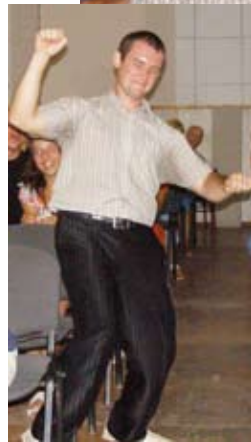
Praise the Lord by flying?