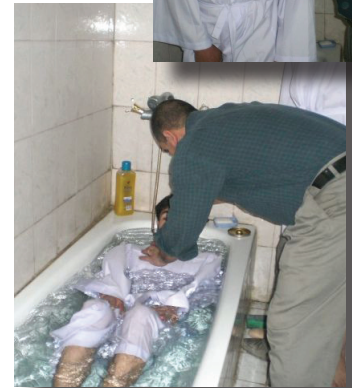
Many new believers have been baptized in R&A's bathroom