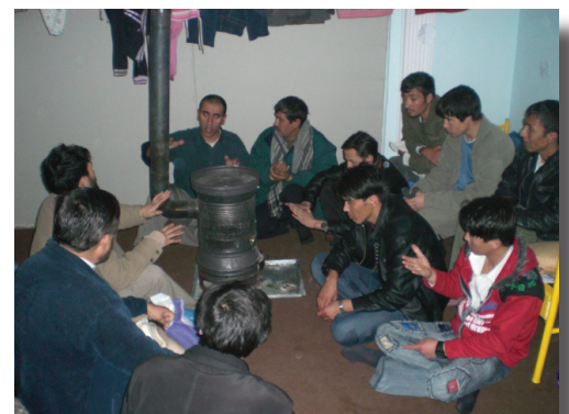
R. is discipling the new believers in typical Asian style, gathered on the floor.