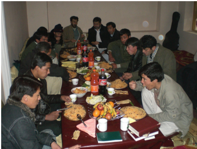
These men in central Asia gave their lives to Jesus in the last few weeks, and were just baptized in water.

Agree with us in prayer for the Lord to raise up and send out new laborers. When God sends the laborers there is always good fruit. People come to Christ if the missionary goes in obedience to the Lord. Also, when the Lord sends the laborers -- not just man sending them -- He adds the financial provision and the anointing of the Spirit which is mandatory to accomplish God's plan.