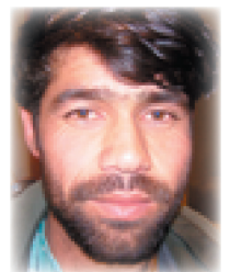
Your new brother in Christ March, 2007