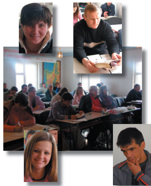
Some of the Bible College and Mission College students who are studying this year.

This was very noticeable in our senior leaders' conference, with perhaps fifty in attendance. These are the heads (plus spouses and a few assistants) of the church planting teams in the sixteen oblasts of Ukraine where there are Churches of Praise.