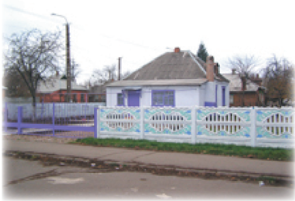
Pastor Marina's Church of Praise purchased and renovated their "prayer house".

cozy meeting place for perhaps seventy five people. These buildings are normally referred to as "prayer houses". Dozens more are now needed!