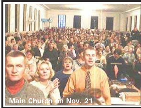
Main Church on Nov. 21

The work of the Churches of Praise is continuing strong. People are being saved in many places, and new churches continue to be planted. Not every church plant is successful, however, and some new works have had to be closed – at least for now.