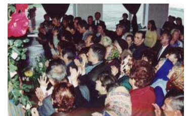
Altar call for salvation, a common occurrence