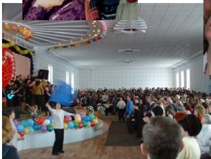
The main Church of Praise