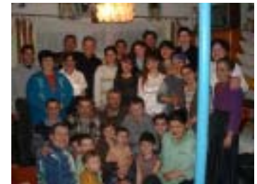
A new gypsy village church