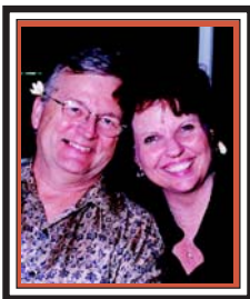
Celebrating 40 years married!