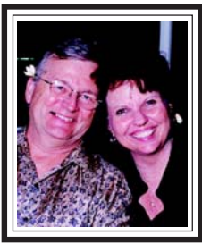
Celebrating 40 years married!